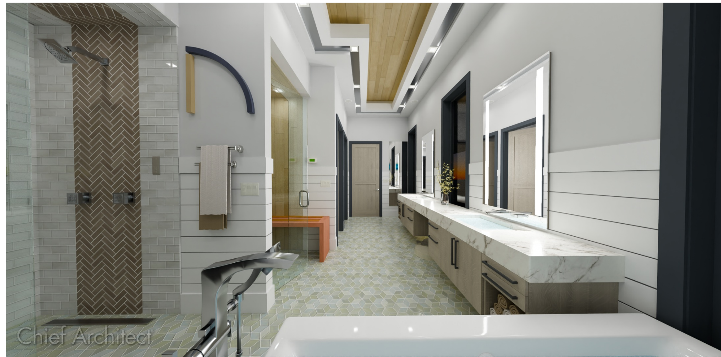
BATH SUITE RENDER FOR ILLUSTRATION ONLY NO SCALE