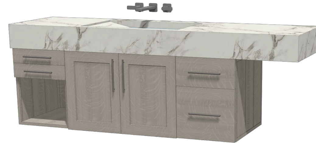
VANITY RENDER FOR ILLUSTRATION ONLY