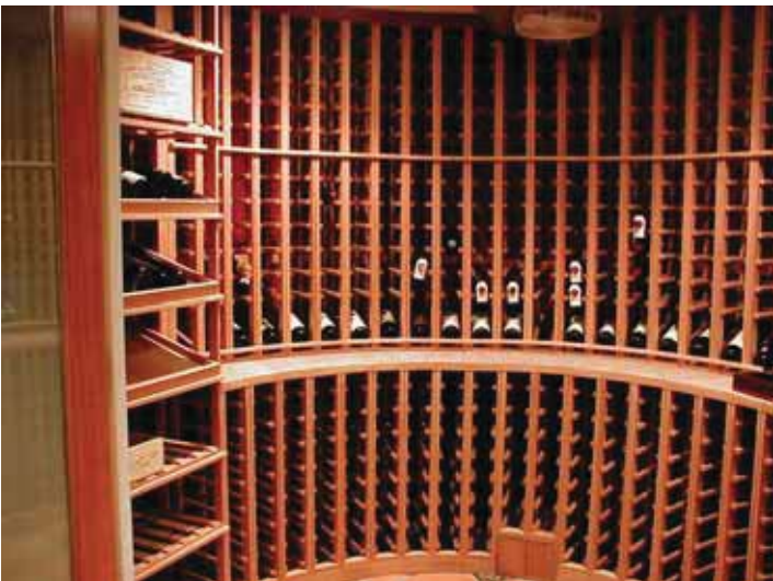
Temperature and humidity can adversely affect the aging process of wine. Because these two factors are so important, Vinotemp Corp. manufactures wine cooling units that will call a homeowner if the wine cellar is too hot or cold.

Wine cellar clients like to set their wine cellars apart and are starting to move to other types of woods, Helm adds. "I do a lot of things in hunter and mahogany, and walnut is becoming popular.