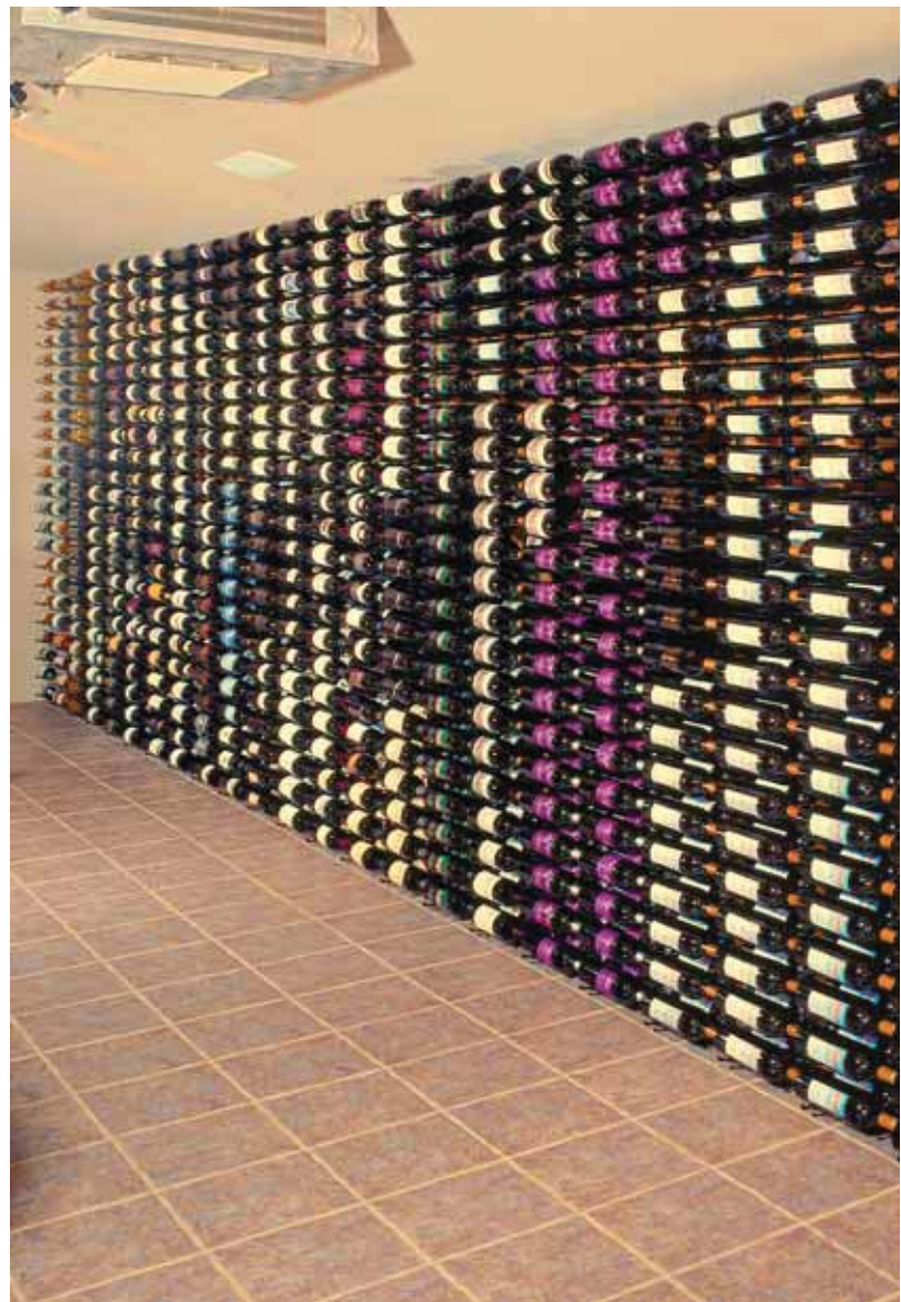
Wine Master Cellars first determines how the homeowner plans to use the wine cellar. If they choose to show off their wine, presentation racks are available. A solid wall of wine is available for the homeowner who wants the wine cellar for storage.