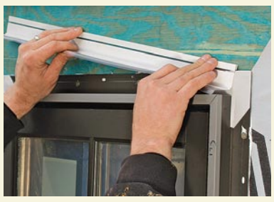
Extra protection for the head jamb. The head jamb is the most-vulnerable part of the window, which is why these windows come with a drip cap that adds a layer of protection. A similar cap can be made with flashing tape and aluminum coil stock (sidebar facing page).

Self-adhesive flashing tapes generally break down into two types: asphaltand butyl-based. Asphalt-based tape can damage certain types of vinyl, so check the window's specs before using it. Butyl tape is easier to work with. It doesn't have an aggressive initial tack, but its adhesiveness increases over time. When possible, we use tapes made by the manufacturer of the housewrap we're using because the products are designed to work together.