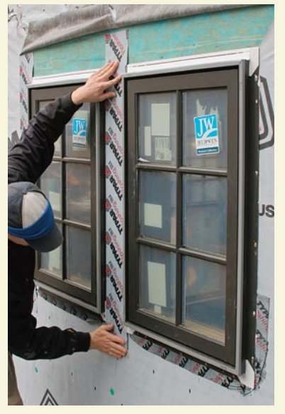
The sides run long. Run flashing tape 4 in. to 5 in. past the top and bottom flanges. Make sure the tops of the side pieces stay at least 1 in. short of the top of the head piece (photo right) so that the head piece will have a good, continuous bond with the sheathing. For windows with integral flanges, like the ones we're installing here, butt the tape tight to the jamb.