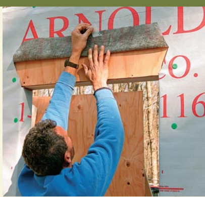
Fold up the top tab, and tape it out of the way.

Staple the tabs down, then cut the top tab.