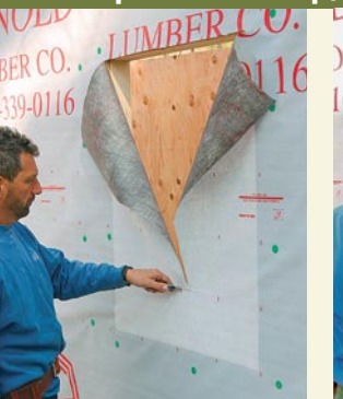
First, cut across the header, then down the center.