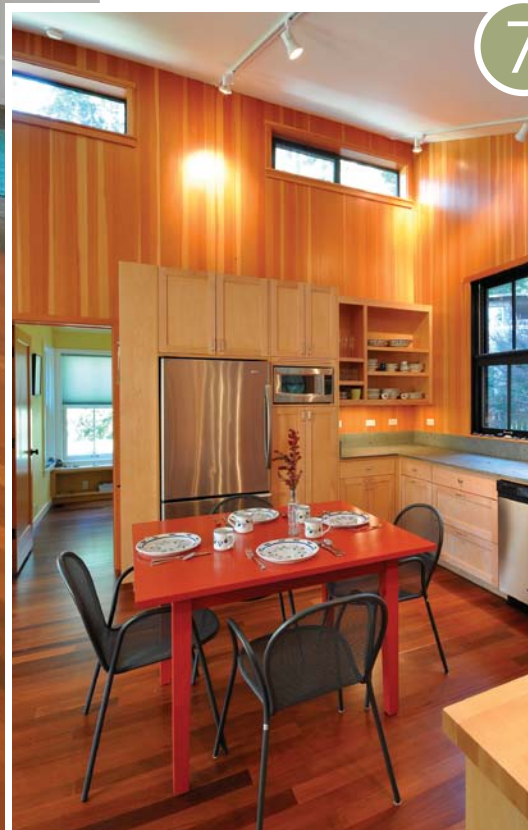
Drawing: Martha Garstang Hill

The diagonal views across the living space are only part of what makes the house feel spacious. The view from the entry through the windows in the study is another, as is the sightline from the bath right through the window of the bedroom. Placing transom windows over interior doors, as was done in the bathroom, channels daylight and views deep into small spaces.