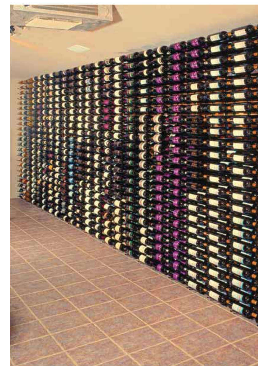
Wine Master Cellars first determines how the homeowner plans to use the wine cellar. If they choose to show off their wine, presentation racks are available. A solid wall of wine is available for the homeowner who wants the wine cellar for storage.