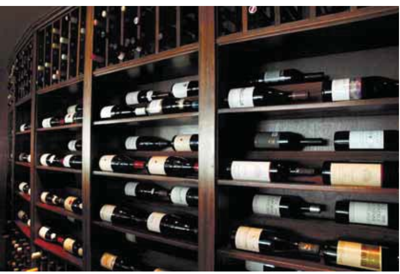
Grotto Custom Wine Cellars offers high reveals, waterfalls or cascades to show off a homeowner's wine collection.

A refrigeration unit is just as important as the insulation. "There are two types of refrigeration: a ductless split system and an air-handler split system. Both operate with a compressor outside, which is similar to a central air-conditioning system for a regular home. The ductless system has a unit that is mounted on the wall in the wine cellar. That one is very easy for remodels or jobs where space is an issue. The